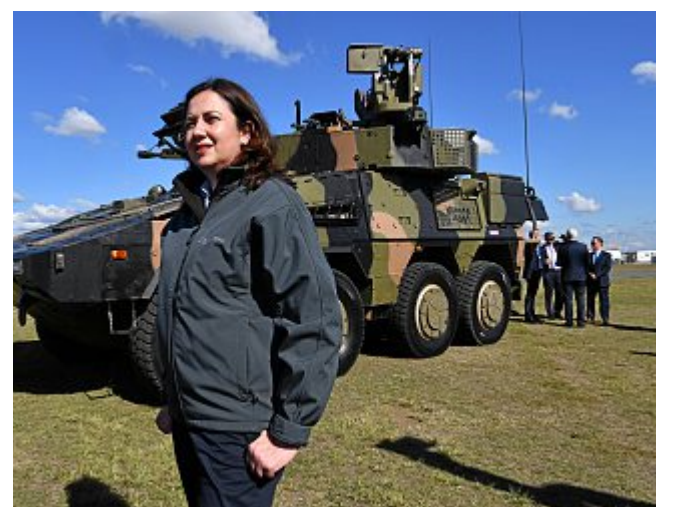
Queensland Premier Annastacia Palaszczuk with the Boxer Combat Reconnaissance Vehicle in Brisbane. Rheinmetall Defence Australia plans to build 225 combat reconnaissance vehicles for the Australian Army.