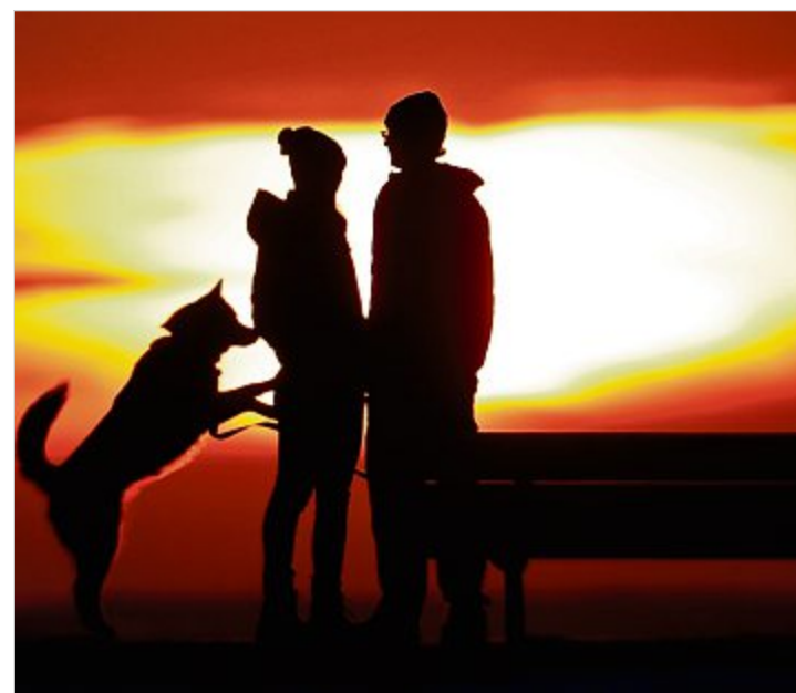
BEAUTY: A couple pauses to take in the view of a colorful sunset while walking their dog in a park on January 28, in Portland, Maine. Southern Maine has been in the midst of a January thaw with daytime temperatures above freezing.