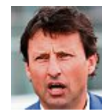
Ramp says NSW Coach Laurie Daley should not blame the refs for his side's defeat.

RAMP. Oh come ob Laurie Daley. Don't bring yourself down to the level of previous NSW Origin coaches. I know it is hard when you have players who have no passion for the game or their state and are just there for the money but whingeing about the refs is not going to fix that. A nice bloke on a shot to nothing. I really do feel for ya.