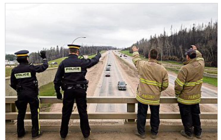
Firefighters and police welcome people into Fort McMurray, Canada on Wednesday June 1. Some residents were permitted to re-enter their homes after being evacuated due to wildfires. Residents started to return to the fire-damaged city in northern Alberta on Wednesday.